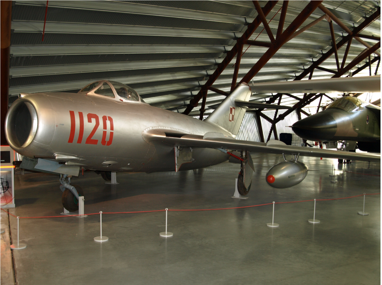
Polish Air Force Mig 15

We shall be visiting the RAF Museum at Cosford , near Telford, on Sunday November 10th at 10:30 . Devamog last visited this spectacular museum almost nine years ago to the day.