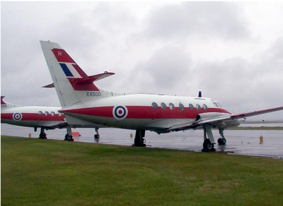
Scottish Aviation Jetstream T.1 (I used to fly the civil version of these - noisy things)

Packed to the rafters with a great display of aircraft, there is also a collection of iconic cars and tanks and Cosford is also home to the world's oldest Spitfire.